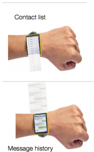
Figure 3. Combining both displays can extend the overall display space of the devices.