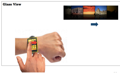
Figure 1. Input on the watch controls the HWD content.