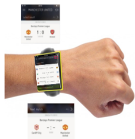
Figure 4. Spatially arranging the displays allows for semantic presentation of content.