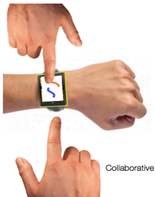
Figure 2. The HWD camera can sense the direction of finger landing on the smartwatch for multi-user sensing.