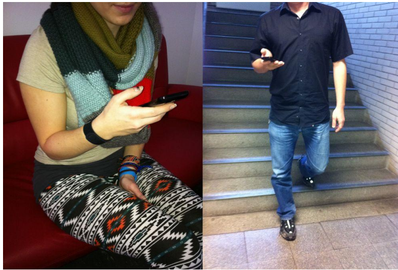
Figure 4: Participant during relax mode (left) and during challenge mode (right)

Questioned if they would integrate or use their environment in a mobile game, e.g. running up stairs, the mean rating was 4.07 on a five-point-scale (1=would not integrate/use it, 5= would integrate/use it).