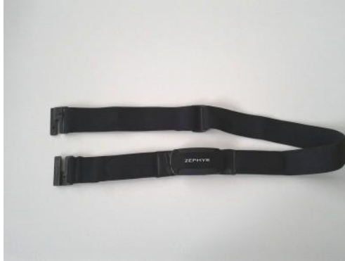
Figure 2: Zephyr HxM heart rate monitor

heart rate, the points will double. To lower the heart rate for the relaxing mode, the gamer can take slow deep breaths or sit/lay down.