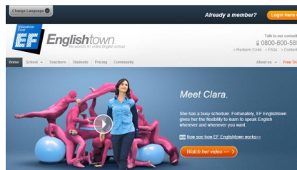
Fig. 2. ET website.

To be sure, the ET website has not been designed with CVM, however, because it is clearly a cross-cultural application that exposes and exploits opportunities to communicate cultural diversity in the linguistic domain, we can use CVM to talk about it , as users or as HCI evaluators and designers. The ET mission, as clearly stated in the website “is to use technology to create a fundamentally better way of learning English. (...)As part of its endeavor to break down borders and remove barriers in language and culture, ET gives students more than just the ability to communicate in a new language” (see Fig. 2).