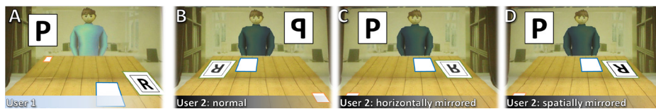
Fig. 1. Different views of the same table: (A) User 1: normal view, (B) User 2: normal view, (C) User 2: horizontally mirrored, (D) User 2: horizontally mirrored and content on the table additionally horizontally mirrored (spatially mirrored). Using a spatially mirrored visualization reduces misunderstandings about left and right and reduces selection times and error rates.

co-located collaboration settings: it is a priori unclear which of the different spatial reference systems of each collaborator someone refers to [16]. Collaborators can share the same point of view, which minimizes reference problems, but this also destroys the feeling of ‘being there’ in a remote collaboration scenario. Contrary to this the collaborators can be positioned on different sides of the shared workspace [10], which offers a good immersion but suffers from different spatial reference systems. While this problem can be mitigated with gazes and gestures in a co-located setting it is hard to properly transfer these additional collaboration information into a remote system. As speakers tend to use their own spatial reference system more often during collaborative tasks [12] this can become a problem during remote collaboration.