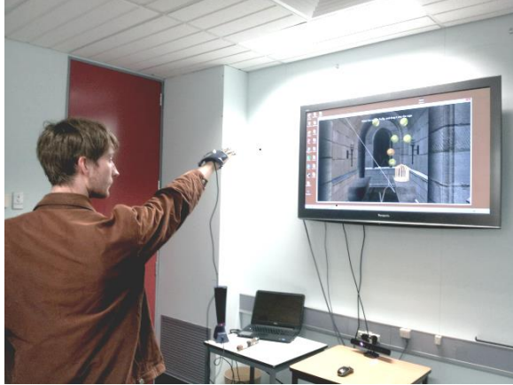
Fig. 1. Selecting a firefly in the select-drag-drop trial using the P5 Wired Glove

The trials presented the tasks consecutively with a brief break between each task explaining what needed to be done before it was begun. At the end of each sequence of tasks, the participant was given a 5-10 minute break to rest their arm before continuing with the next interface device.