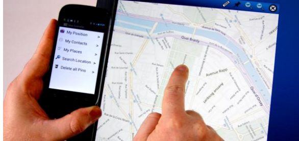
Fig. 1. Spanning a mobile user interface across the mobile phone and an external display, here showing a map application.

In this paper, we contribute MOBIES, a system that allows users to extend their mobile applications through temporarily spanning the user interface across multiple screens. In short, the technique requires users to touch the border of an available screen (e.g., a public display, TV, or desktop screen) with their phone during the interaction. The system detects this event and initiates the distribution of the user interface across the mobile and the external screen (see Fig. 1). Subsequently, users benefit from the extended screen space which facilitates tasks such as viewing a map, browsing the web, or showing and exchanging pictures to and with other users. When the phone is removed from the border of the external screen, the user interface returns to the original mobile mode. That is, users can take advantage of existing screens in their environments without the need to carry additional hardware.