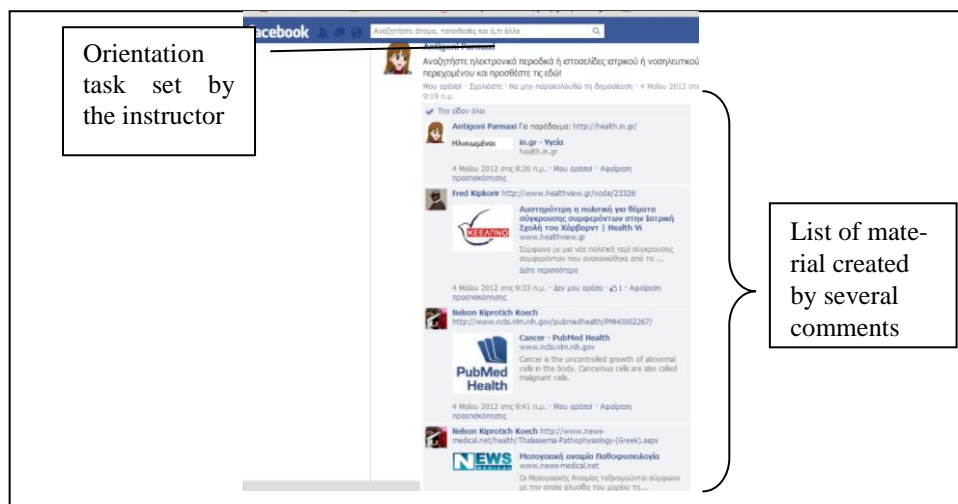
Fig. 1. Screenshot of social brainstorming in Facebook group.

forward, social constructionism assumes that learners can socially exchange “germs” or “seeds”, throughout the brainstorming phase. In the framework of social constructionism, learners interact and exchange material throughout social communication channels. Facebook has been used as a tool for listing resources related to a specific topic. As it is shown in figure 1, an orientation task has been set by the instructor on Facebook requesting from students to search for material related to a specific topic. Participants have been listing related material by posting comments with material related to the specific topic.