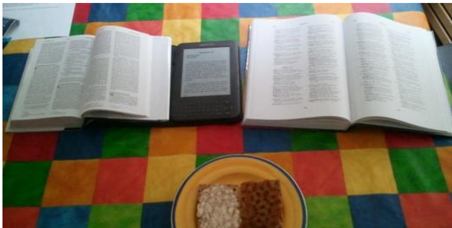
Figure 1: Integrating the e-book into an established morning routine of studying the bible in English (left) and Greek (centre) with the help of a Greek dictionary (right).

Some participants, however, came by their devices more reluctantly, sometimes being given them as presents or being given older devices that had been replaced by newer models. As p9, said: I didn't ask for it, my husband got it for me as a present. I was resistant to it because I like books, the feel of them, the variety of them, and that hasn't stopped through having an e-book, it has just supplemented it. In this instance, we can see some concern that something might be lost through the transition from physical to e-books. To p12, on the other hand, receiving a device was a revelation: because I've not really read much for a long time because of the slight dyslexia [] I thought I can't imagine it's going to make that much of a difference but it really has; [] I'd say that I definitely be reading more, it just makes things more accessible for me really and I enjoy it.