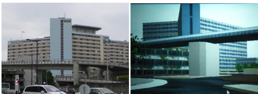
Fig. 1. Screenshots our real (left) and our virtual environment (right).

The real environment was a 9km 2 area. The VE was a 3D scale model of the real environment, with realistic and visual stimuli. The scale of the real environment was faithfully reproduced (measurements of houses, streets, etc.) and photos of several building facades were applied to geometric surfaces in the VE. Significant local and global landmarks (e.g., signposts, signs, and urban furniture) and urban sounds were included in the VE (see Figure 1). VE was laboratory-developed using Virtools Dev 3.5™. Irrespective of the interfaces conditions, the itinerary was presented to participants on the basis of an egocentric frame of reference, at head height. It was characterized by an irregular closed loop, 780 m in length, with thirteen crossroads and eleven directional changes.