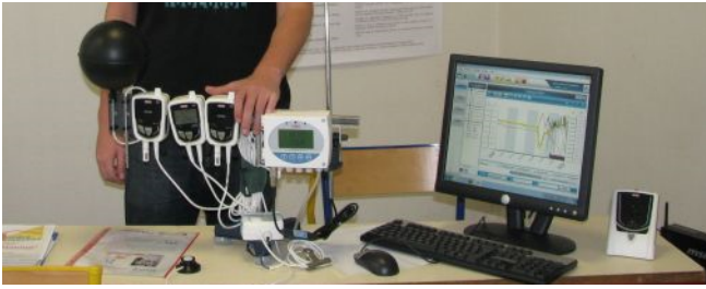
Fig. 2. Monitoring the comfort of users involve to monitor various aspect of the environment such as the temperature, CO2 levels, humidity, etc.

to management, and to the public. This raises the problems of privacy and security, as some data should be anonymized before being shared and not all data should be public. This is why ethical, legal, and safety committees are also involved in the design of our platform.