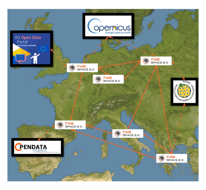
Figure 1: FabSpace geo-information platforms creating a European network sharing data, services and users

The aim of FabSpace platform is to simplify and to standardize the access to geographic data in order to facilitate their integration in space application prototypes. The networking of the six FabSpace platform will ease data and service exchanges and will allow the creation of user community.