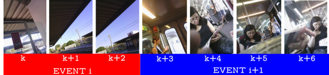
Fig. 1: Examples of temporally adjacent events in an egocentric photostream, from the EDUB-Seg dataset [4].

Model assumptions and intuitions. The key assumption used in our frame modeling is that an egocentric photostream can be considered as a fairly general stationary random process, meaning that, as the length of the photostream grows, for every small temporal segment in the sequence, it is possible to find many similar temporal segments in the same sequence. This is intuitively true when looking at the semantic representations of small temporal segments, rather than the temporal segments themselves. For instance, all small temporal seg-